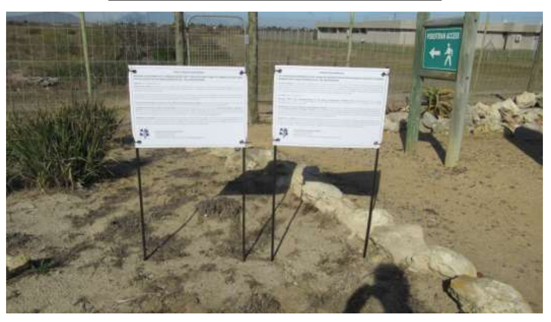
Duynefontein suburb Entrance to KNPS (33°40'31.58"S; 18°26'22.04"E)

R27 road Entrance to KNPS (33°40'30.45"S; 18°26'6.79"E)