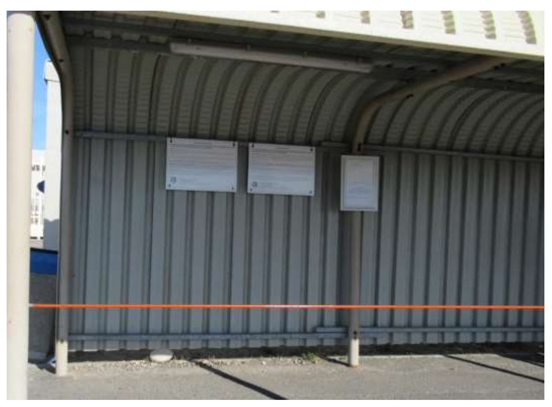
Access Control Point 2 to KNPS site (33°41'28.17"S; 18°26'33.71"E)

Access Control Point 1 to KNPS site (33°40'36.38"S; 18°27'22.10"E)