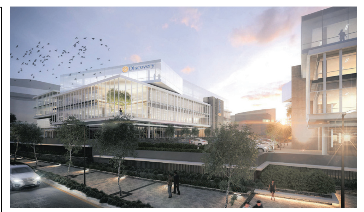
New offices under development at Century City